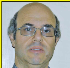
Jacki Masteroides AFTER